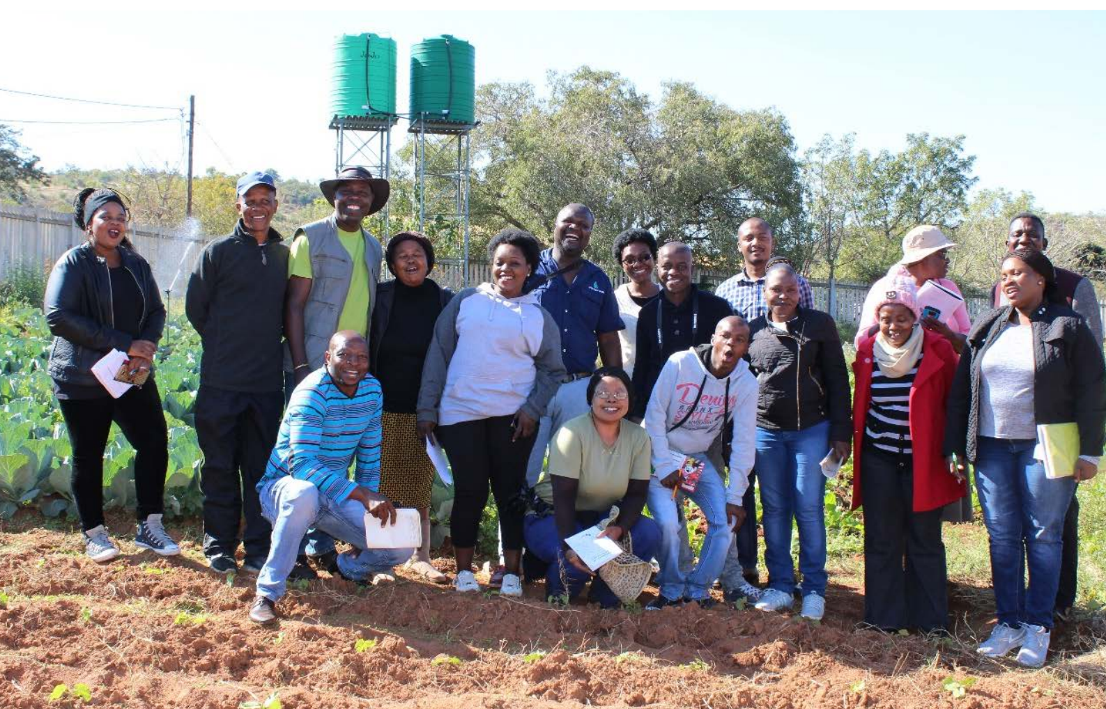
Group photo with stakeholders who visited farmers in the Middle Olifants