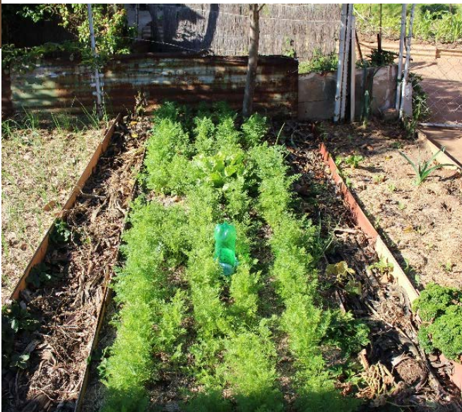
Joel's neatly maintained garden