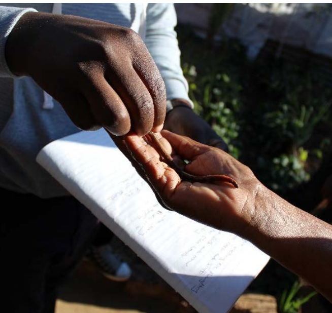
An earthworm, which is an indicator of good soil is shown to farmer