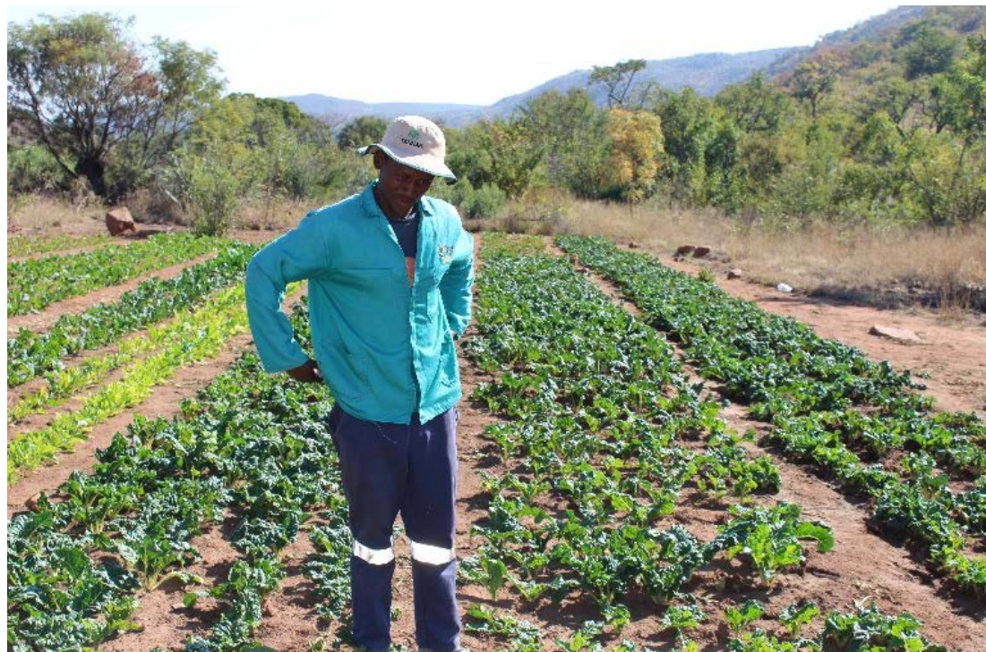
Prince in his spinach garden