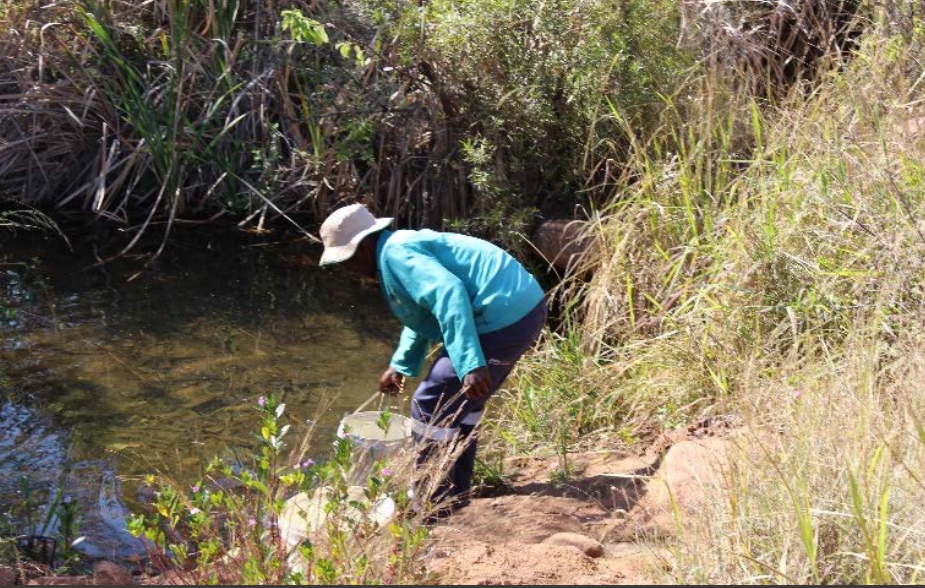
Farmer collecting water at a nearby river for irrigation