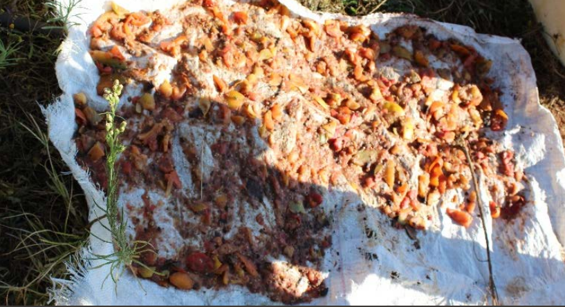
Farmer drying tomatoes given by ZZZ for seeds