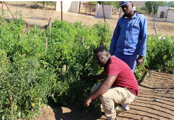
Tomatoes growing very well