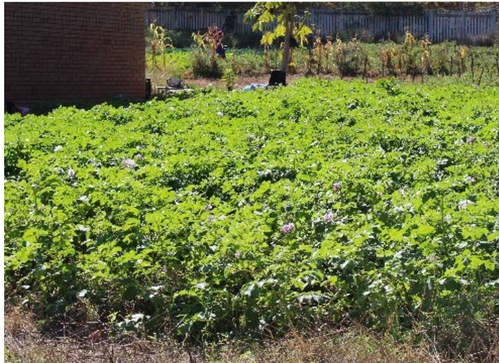
The Cossa's blooming greens