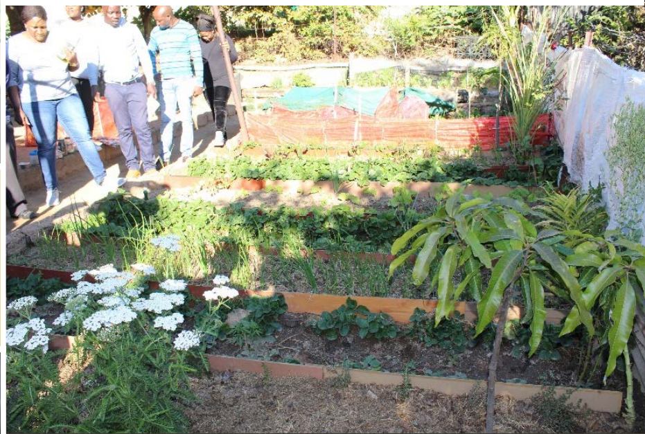
The gardens consist of herbs, vegetables and fruit trees