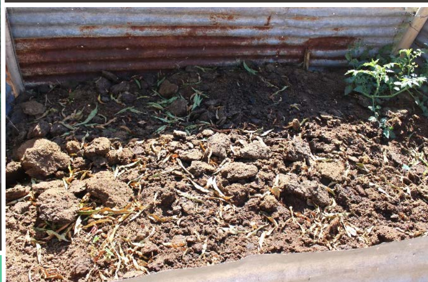
Animal manure for building soil fertility in the garden