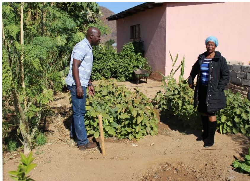
Butterbeans and legumes in the garden