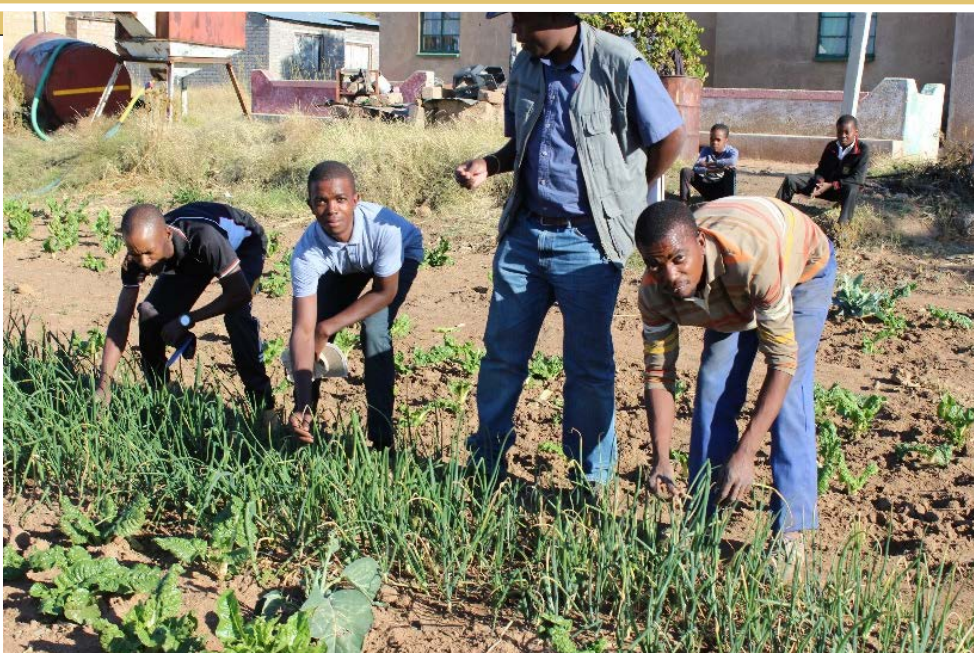
Youth farmers showing us their vegetables garden