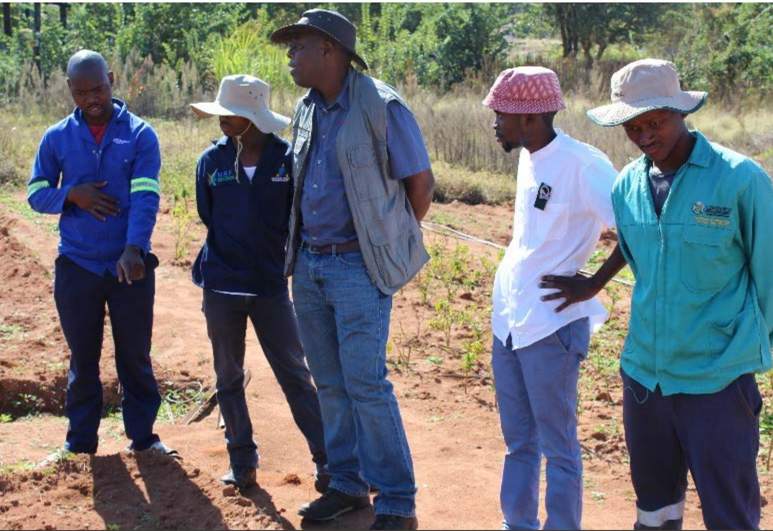
Youth farmers in Motetema showcasing their garden and their poorly planted carrot crops.