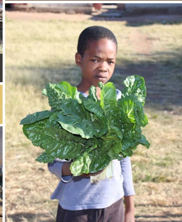
Spinach bought from the youth in Tafelkop