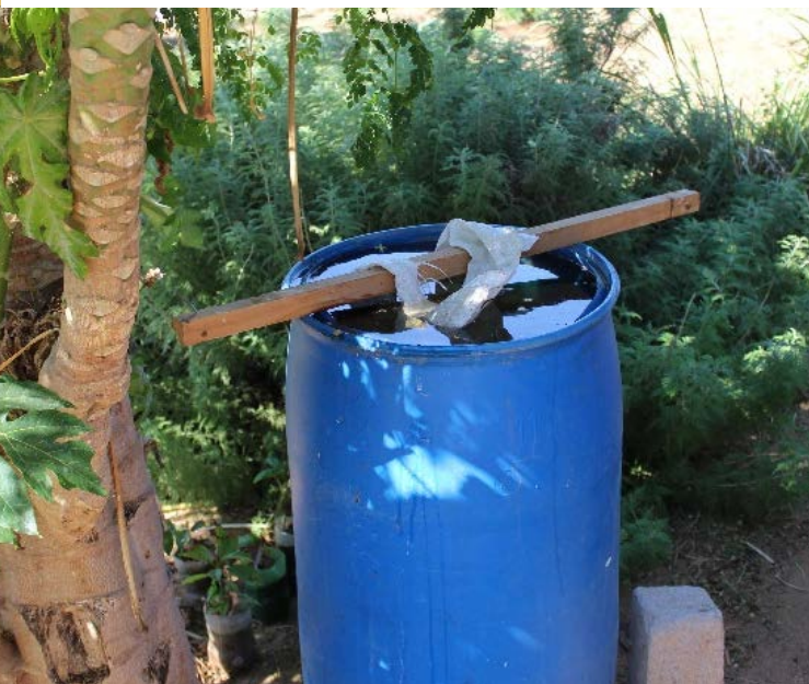
Liquid manure from animals to reduce weed growing in the garden and increase yield