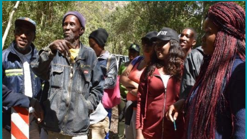
Youth listening to one of the elders during the historicity and mapping session during the LNR Youth Engagement Workshop in September 2017