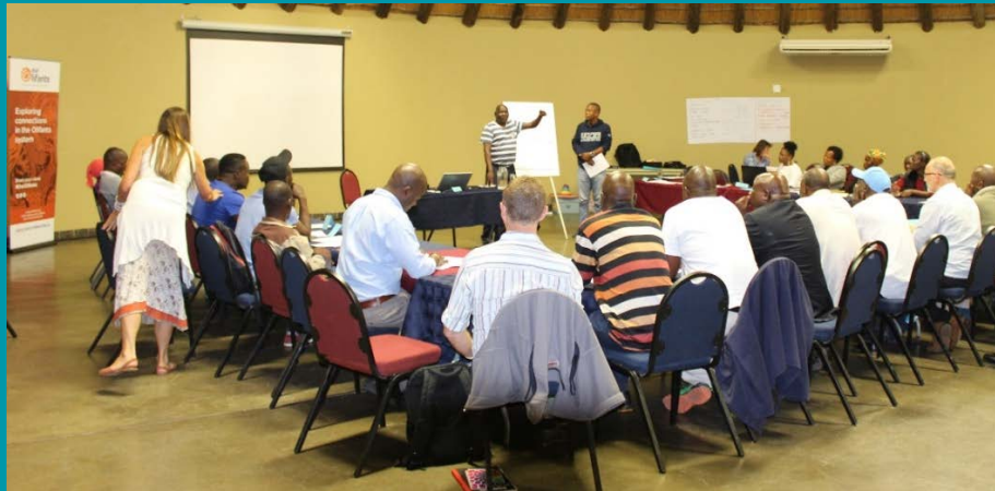
LNR communities sharing co-management experiences and lessons