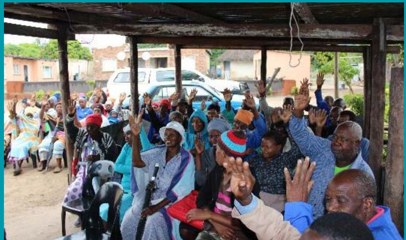
Community decides to include a portion of land within the LNR