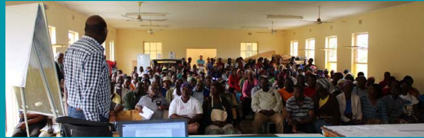
Co-management engagement with wider communities

Participation is important in co-management as it allows all the concerned parties to take part in decision making related to the conservation area. This reduces conflict between the communities and the protected areas management agents. It is also an important principle for good governance