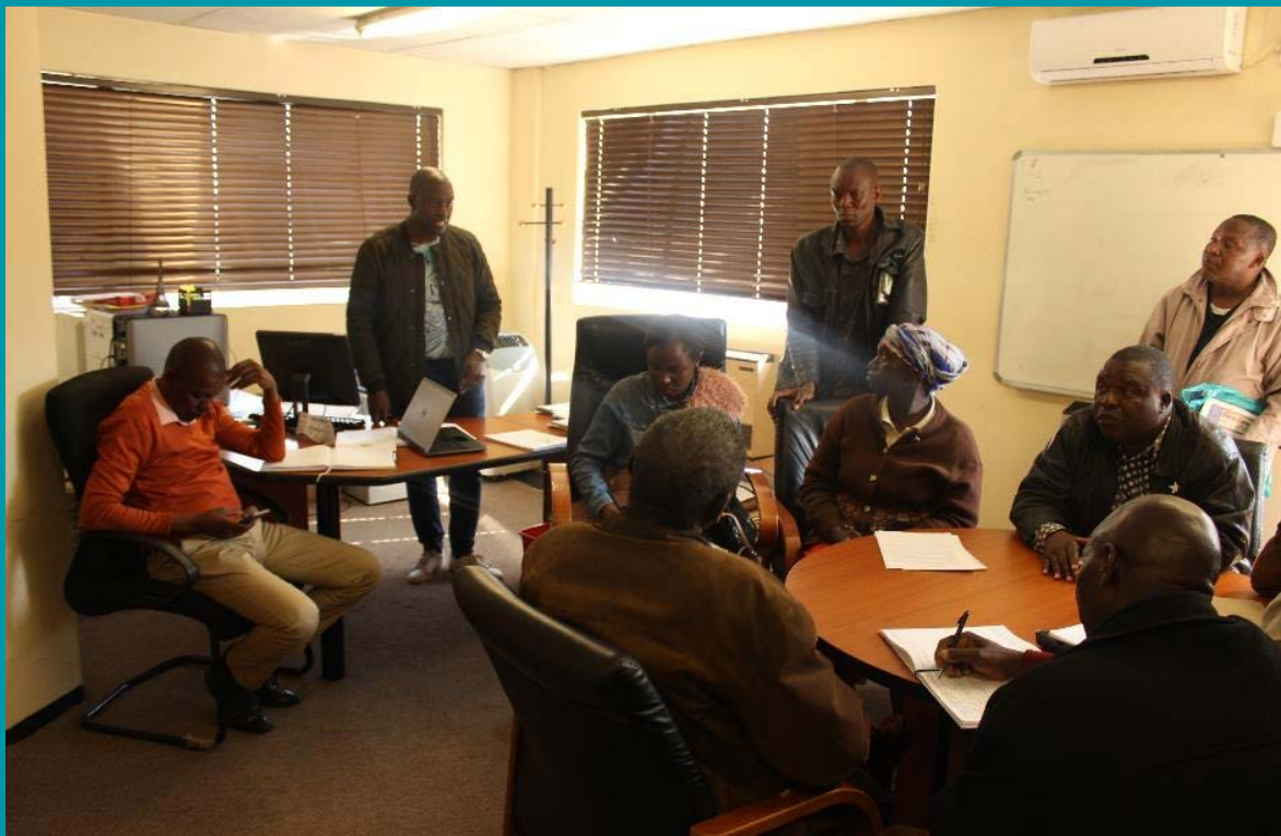
Communities using strategies to engage with a government agency

Other challenges relate to how to convey community concerns to government agencies when a meeting has not been called; how to initiate discussions with government, which department to approach and how, and general lack of awareness on government procedures for certain processes such as co management.