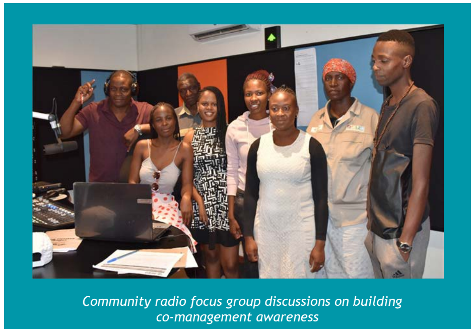
Community radio focus group discussions on building co-management awareness

Most decisions by government departments in co- management (e.g. DRDLR and LEDET) are through public consultations with the communities. The decisions reached are based on the contributions of the vocal members of the community. In this regard it is important that members of the CPA develop their skills in participating in public meetings.