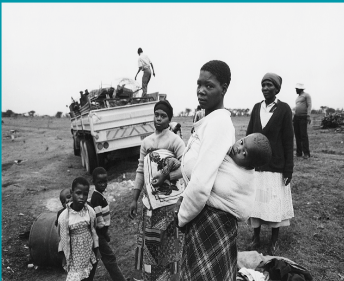
Figure 1: Forced removal picture

This communication or awareness pamphlet is targeted at communities that have claimed land in protected areas within South Africa, and are in the process of or have already negotiated partnerships with the government management agencies for joint management of protected areas. It is also useful for the facilitating organisation and the government agencies and departments involved in the process in their engagement with communities.