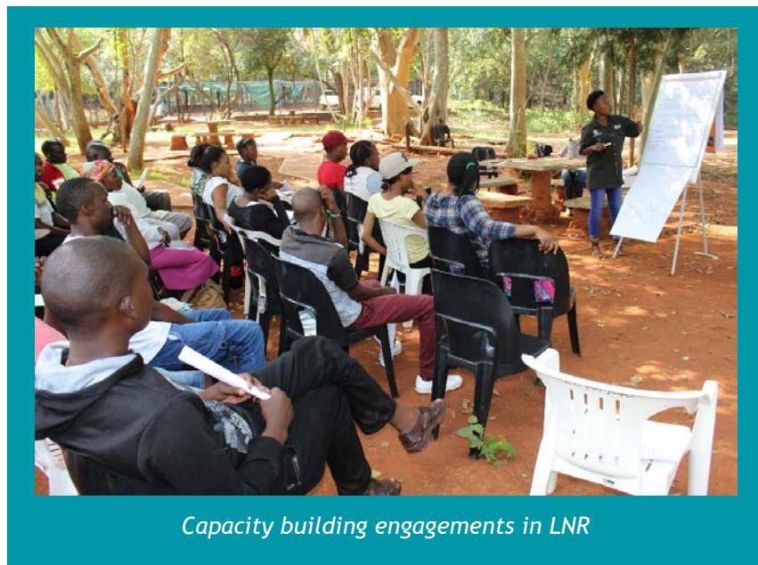
Capacity building engagements in LNR