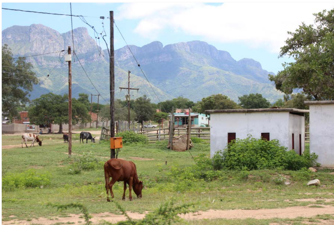
Figure 1: Rural residential areas located within the Maruleng local municipality were previously not part of town planning

Before 1994, spatial planning was designed to serve a purpose of racial segregation. In this regard land use was not the most efficient. Provincial governments played a bigger role in provincial planning and land use management (SPLUM). Historically, municipalities played a role primarily in urban development control. In some parts of the country provincial government would delegate decision-making powers to its local municipalities to oversee certain types of land development applications. For example, the process of town planning and township establishment was overseen by municipalities governed by ordinances . This municipal planning function was restricted to the development of town or urban areas. Town and regional planning as a field finds its place in this view of land development. Rural areas were not included in land use management by municipalities - most rural areas were part of what was known as homelands which were under traditional leadership.