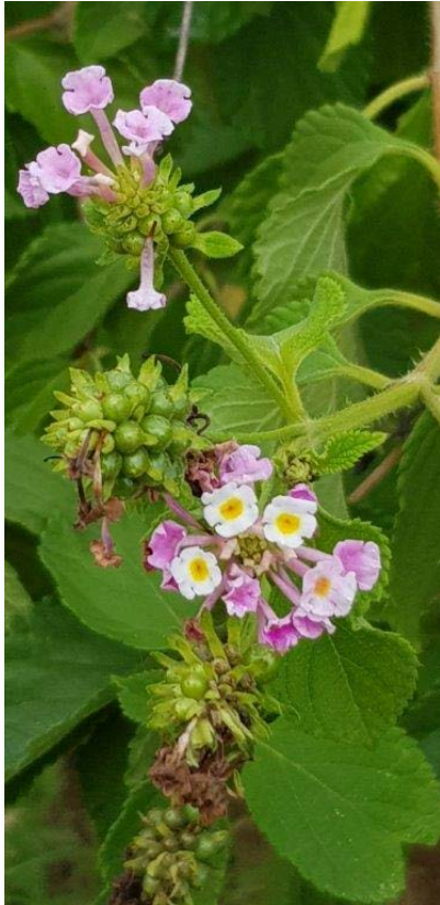
Lantana Camara Problematic Alien invasive